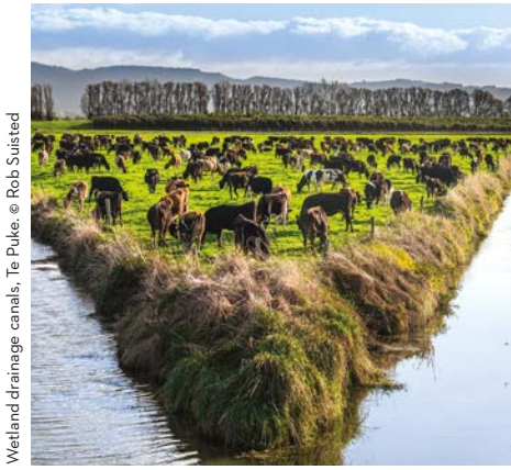
Wetland drainage canals, Te Puke.