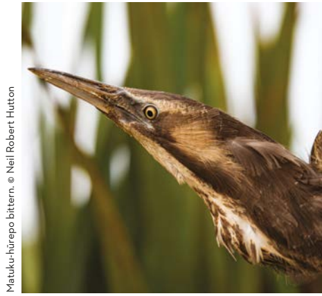
Matuku-hūrepo bittern.