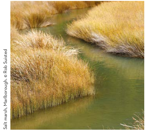
Salt marsh, Marlborough.